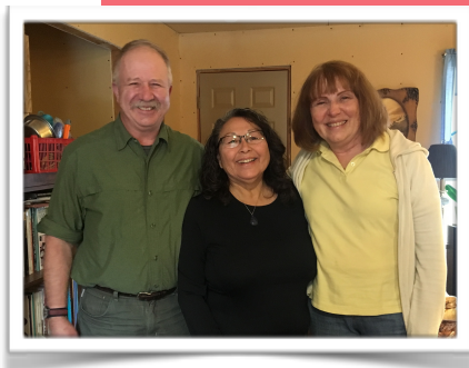
Enjoying a visit with N